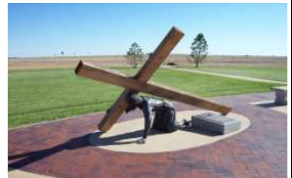
This picture was taken in Groom, TX in 2011 Life-sized metal statues of the Stations of the Cross

We will be having the Stations of the Cross every Friday afternoon at 3:00pm beginning February 24, through Good Friday of the Passion of Our Lord on April 6. Please plan on joining us each week as we walk with our Lord. Remember, everyone wanted to be present when Jesus was feeding the crowds, but who walked along the Via Dolorosa when He carried the cross to Calvary? Were you there?